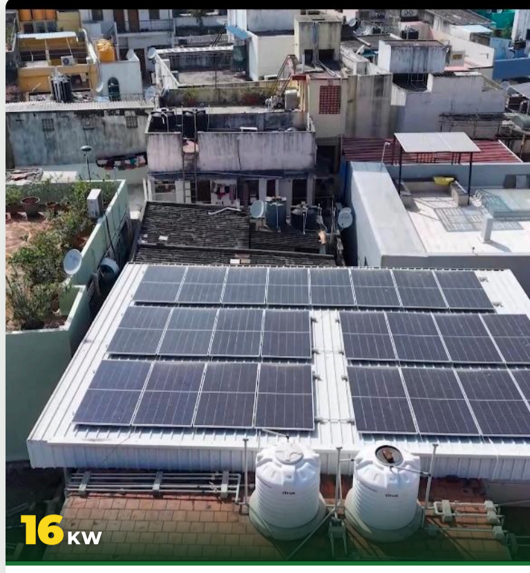
RESIDENCE Residential Chennai ON-GRID ROOFTOP FLAT TERRACE NET METERING MONO PERC