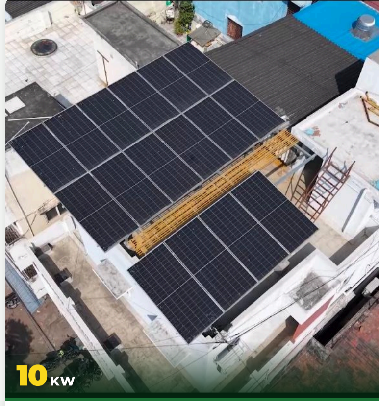
RESIDENTIAL ASSOCIATION Community Solar Chennai ON-GRID ROOFTOP TERRACE MOUNT NET METERING COMMUNITY